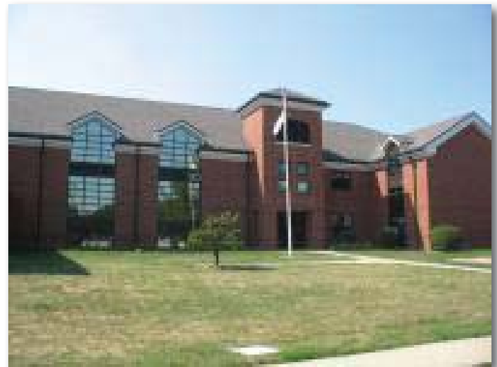
Sangamon Elementary School

Source: Illinois State Board of Education, FY11